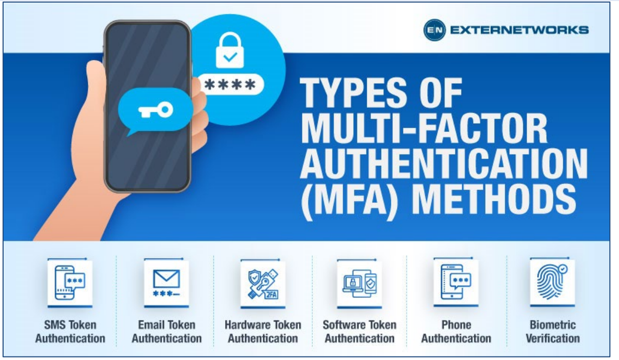
Figure 5: Examples of multi-factor authentication (MFA) method.

March 1, 2024 TLP:CLEAR Report: 202403010800